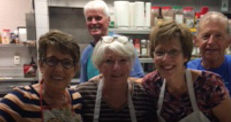
Volunteers at St. Catherine Laboure Parish before the outbreak, who are now staying home - praying for those they have served!

Please offer your prayers and, if possible, make a donation directly to a Vincentian parish near you.